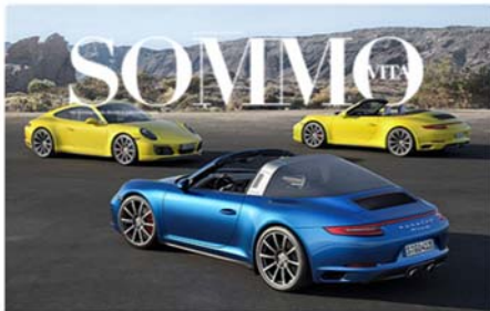
SOMMO VITA Luxury

With over 10 million obsessed readers – Opulence has the most influential online lifestyle properties on the planet.