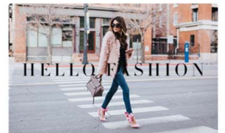
HELLO FASHION Fashion