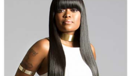
#HALOEFFECT DAILY Entertainment