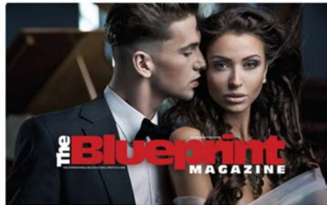
THE BLUEPRINT STYLE Fashion