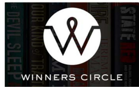
WINNER'S CIRCLE BOOKS Books