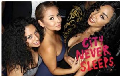
CITY NEVER SLEEPS Nightlife