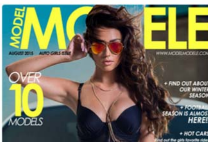
MODEL MODEL Modeling